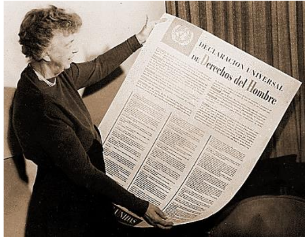
Universal Declaration of Human Rights 1948

“Unless these rights have meaning in the small places close to home, they have little meaning anywhere.”