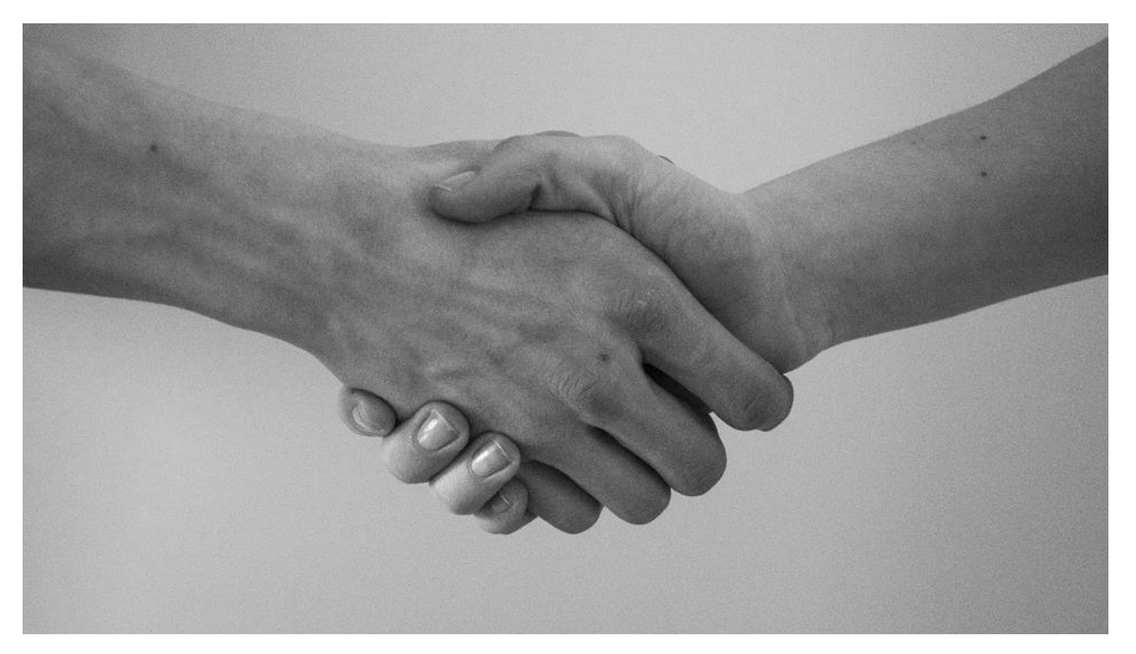
"Nothing about me without me"