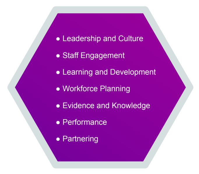
Figure 2: People Management Priorities (HSE, 2015)

It identifies the following people management priorities that will be targeted for action recognising the need for leadership and support at every level to implement improvements: