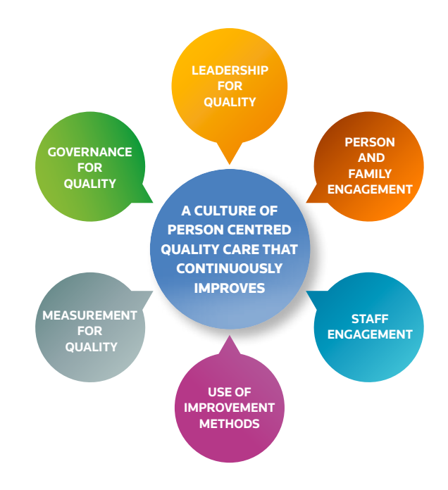
Figure 1: Framework for Improving Quality (HSE, 2016)

Each driver outlined in the Framework for Improving Quality is linked to the Framework for developing PPPGs and will be integral to the implementation process.