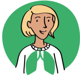
Asthma & COPD

Connecting people living with long term health conditions to services and services to each other